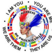
Alianzas de Phoenixville