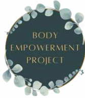
Body Empowerment Project

Out of the 13 organizations that received funding this year, all 13 are led by women of color. 12 of the organizations have budgets under $200,000 and all 13 have budgets under $500,000.